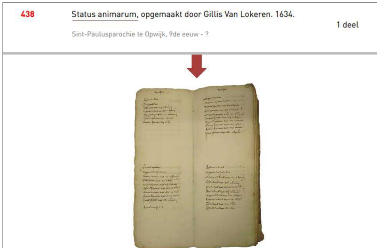
Image 2 | The TEMAS thesaurus supports archive users in the 'translation process' from the technical description of an item to the actual item itself

types and provide little context information. TEMAS transgresses these limits by combining both approaches: for each lemma, definitions are linked up with references to context information. TEMAS leaves it up to its users to choose to which level they want to deepen their knowledge on record types, but always offers basic support for the interpretation of archival descriptions of early modern archival sources.